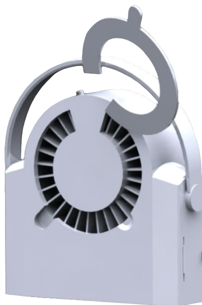
Figure 2. Removing the drum cover